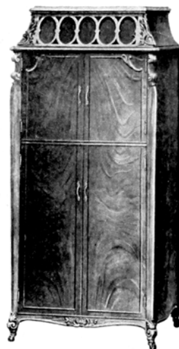
No. 250, Closed

Still a few desirable openings for jobbers.