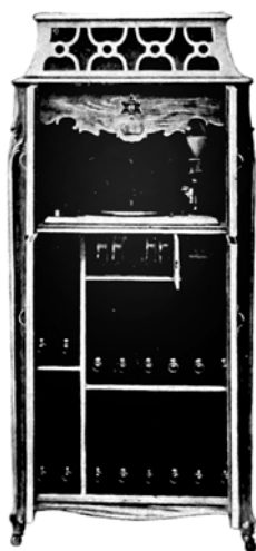
No. 175, Open

Q Immediate deliveries for Holiday trade. Our attractive discounts and selling conditions are very interesting to both jobbers and dealers.